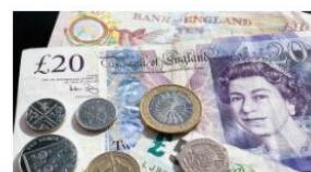
Housing and finances

The Family Hub has been developed to provide you with a range of different types of resources that are available to you online, on the phone or face to face that you can access directly.