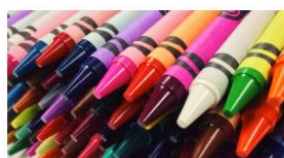
SEND Local Offer