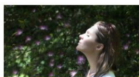
Health and wellbeing